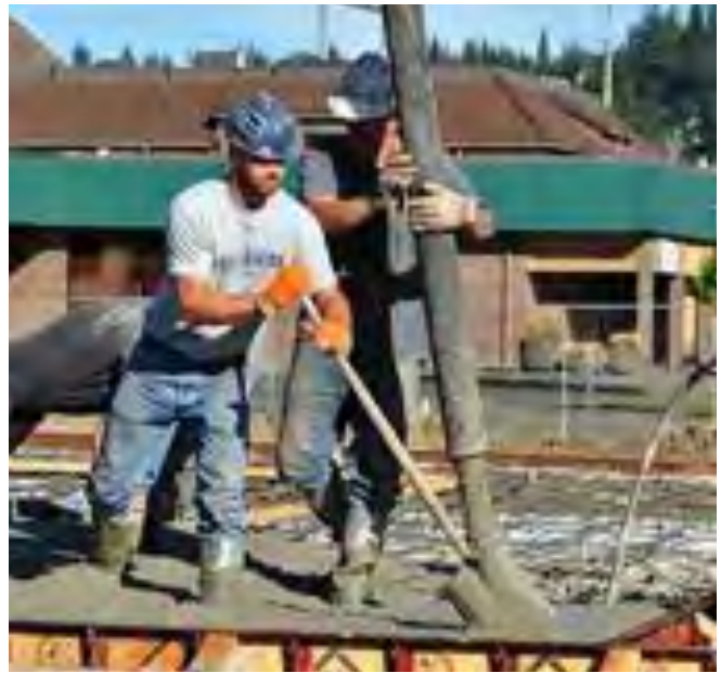
▲ The recent American Recovery and Reinvestment Act, funding projects such as this future transit center in Aberdeen, Washington, has accelerated transit expansion.

By taking these approaches, we can create a future where every American can get to work and school via public transportation—subways, rail, buses, walking, and biking. People are voting with their feet and moving to public transportation in increasing numbers—it is imperative that policy and investments accentuate and accelerate this trend in order to achieve energy independence and solve global warming.