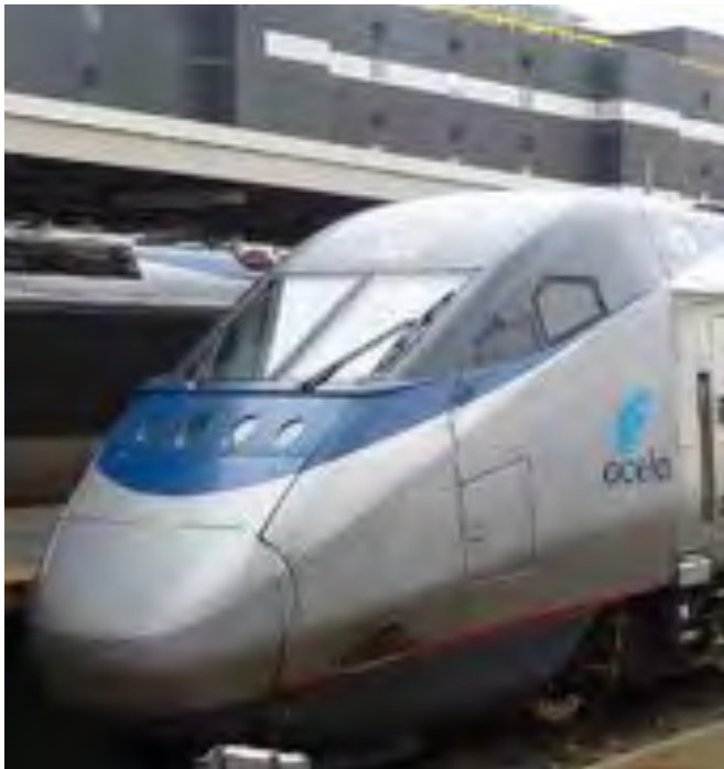
▲ Four in five Americans believe increased investment in public transportation strengthens the economy, saves energy, creates jobs, helps reduce traffic congestion and decreases air pollution.

A century ago, trolleys and streetcars—the precursor of today's modern light rail and subway systems—facilitated the growth of American cities large and small, giving people more trans-