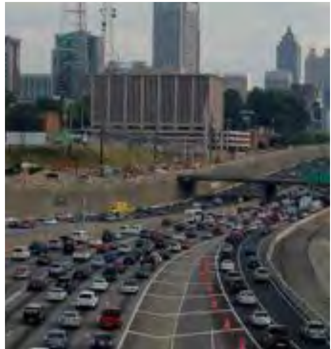
▲ Transportation accounts for about two-thirds of all U.S. oil use—nearly 13 million barrels of oil per day.

Record ridership shows clear, growing demand for public trans-