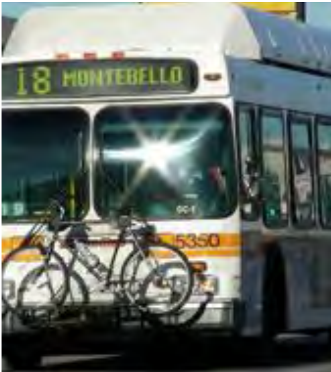
▲ With advances in cleaner fuels, like this bus running in compressed natural gas, public transportation is becoming more efficient and less polluting over time.

is consumed for low-density housing and commercial development;