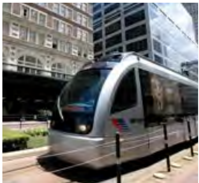
▲ In 2008, light rail had the highest percentage of annual ridership growth among all transit modes—an 8.3 percent increase. (Photo - Houston Light Rail, Ed Schipul.)