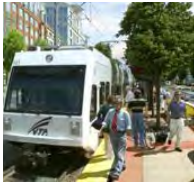
▲ Four in five Americans believe increased investment in public transportation strengthens the economy, saves energy, creates jobs, helps reduce traffic congestion and decreases air pollution.

Existing systems would undergo significant expansion, allowing the largest urban systems to expand heavy rail and grow light rail and bus rapid transit systems linking urban centers and suburban areas. Commuter rail and new high-speed rail