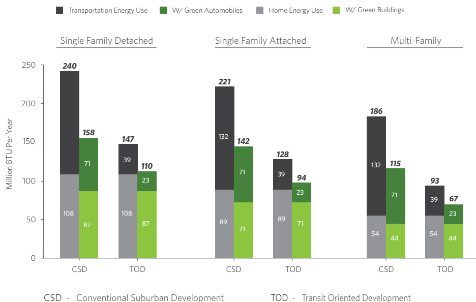
Location Efficiency: Household and Transportation Energy Use by Location